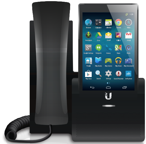
Multi-Touch Color Display

5" or 7" High-Definition, Multi-Touch Color Display Navigate the UniFi VoIP Phone using the touchscreen display.