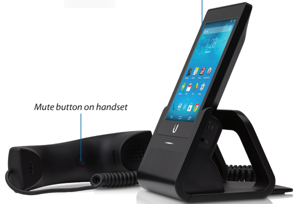
Mute button on handset